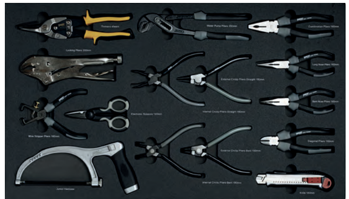
PLIERS, CIRCLIPS PLIERS AND CUTTING TOOLS