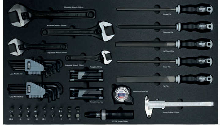
IMPACT DRIVER, ADJUSTABLE WRENCHES, HEXAGONAL KEYS, FILES AND MEASURING TOOLS