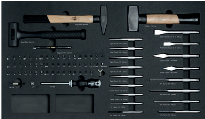
BITS, HAMMERS AND IMPACT TOOLS